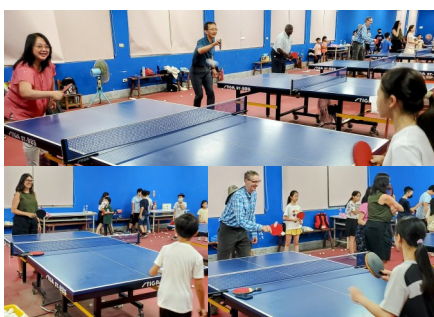
English Summer Camp