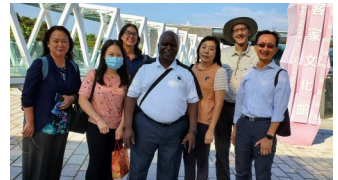
Outside the Museum