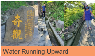
Water Running Upward