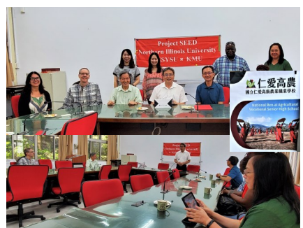
Panel Discussion at Ren-ai Vocational HS

On June 29th, we participated in panel discussion sessions with 5 teachers, 3 directors, and principal from National Ren-ai Agricultural Vocational Senior High School in Nantou. Despite being located in a somewhat remote area, their curriculum still follows the mandatory regulations of the new Taiwan curriculum. Interestingly, the principal mentioned that this school had already been implementing similar curriculum