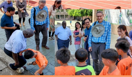
One of the Students' Summer Clubs