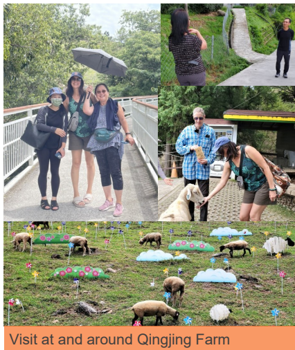
Visit at and around Qingjing Farm

English). One of the teachers mentioned that the most important factor for students' lifelong learning is students' interest in that subject; as long as the student has interest, they will be willing to learn.