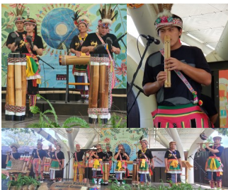
Amis Folk Center