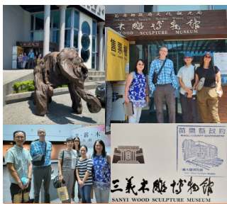
Sanyi Wood Sculpture Museum