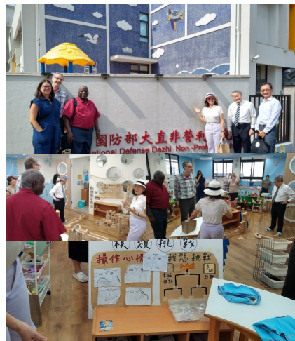
Visit to National Defense Dazhi Non-Profit Preschool

On July 4th, we visited Shih Chien University in Taipei and the National Defense Dazhi Non-Profit Preschool. This preschool runs with operational support from Shih Chien University; was opened in 2020 by the Ministry of National Defense (MND) for children of military servicemembers. At this preschool, we learned about the school's learning environment and curriculum.