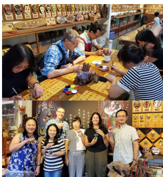
Hakka Face Painting Center