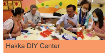
Hakka DIY Center