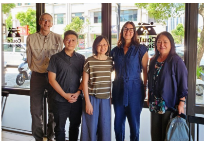
With Discussants at Cafe

On July 6th, we participated in panel discussions with 4 directors, 4 teachers, and 4 parents from Xin-Gang Elementary and Junior High School in Miaoli. In order to develop students' lifelong learning, teachers in elementary and junior high school stressed the importance of having students understand for themselves (through