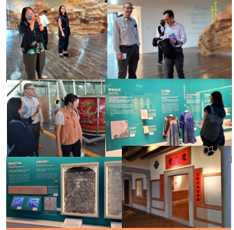
Inside the Hakka Museum

After visiting the exhibit, we went downstairs to do DIY activities that contained Hakka cultural aspects. The activities that we chose were making pickled vegetables, but with simplified steps, creating a keychain that showcased Hakka life (e.g., clothing), and creating a plush in the shape of food that is commonly found in Hakka culture.